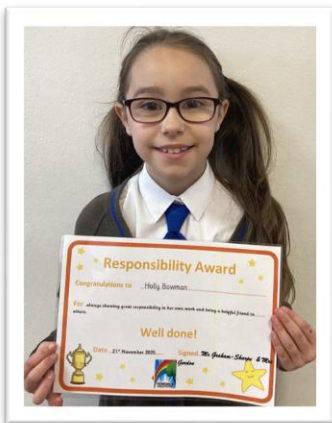
Hawthorn Class – Holly