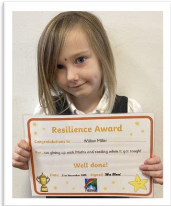
Aspen Class – Willow